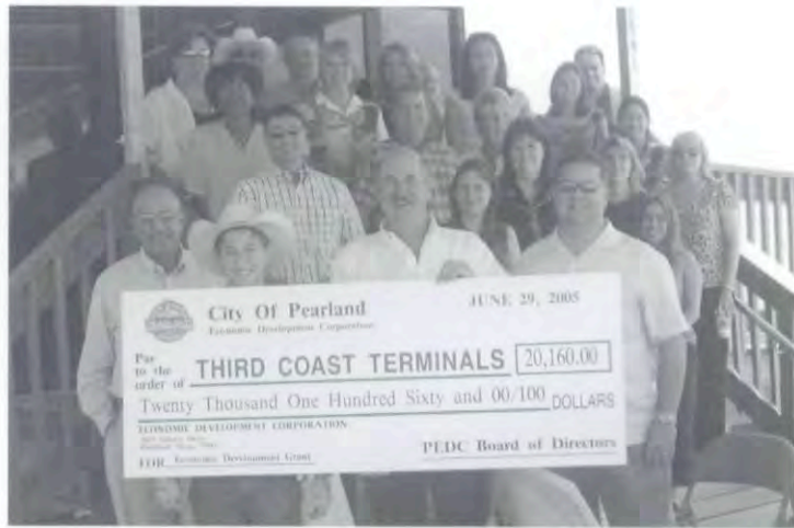
Third Coast Terminals received assistance from the PEDC for the installation of a concrete street along the company's new 6-acre development property.

"True assistance is keeping a business working and viable by allowing that business to keep