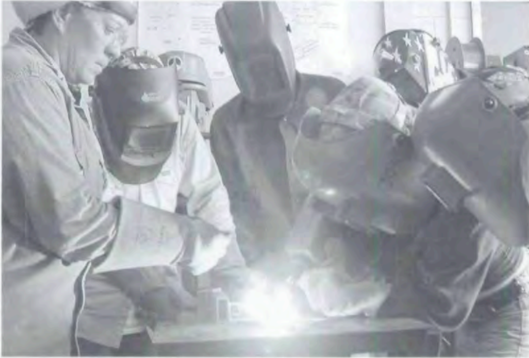
Onsite training for welders at Dynamic Lighting.

Every economic developer knows how important it is to have some sort of business retention or outreach program to the local businesses in one's community.