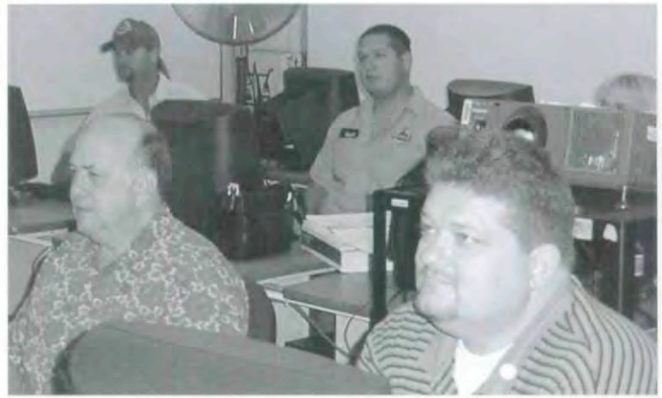
Computer Training at Alvin Community College – Pearland Campus for local businesses.

With the coordinated efforts of the city, ShawCor received its Certificate of Occupancy from the city