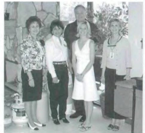
BRE Team visits local company – Specialty Gas Company.

The next day, after the conversation with the business owner, we went out and made business calls — unannounced and without appointments. We would arrive at a business and someone (usually the business owner) would eventually take time to talk to us and tell us about the business, often times giving us a tour of the facility. We may have had to wait 10, 20 or 30 minutes before we could be seen, but our persistence and patience usually paid off. At that time, we would educate the individual about the programs that are available to businesses and how the PEDC could help him or her in accessing