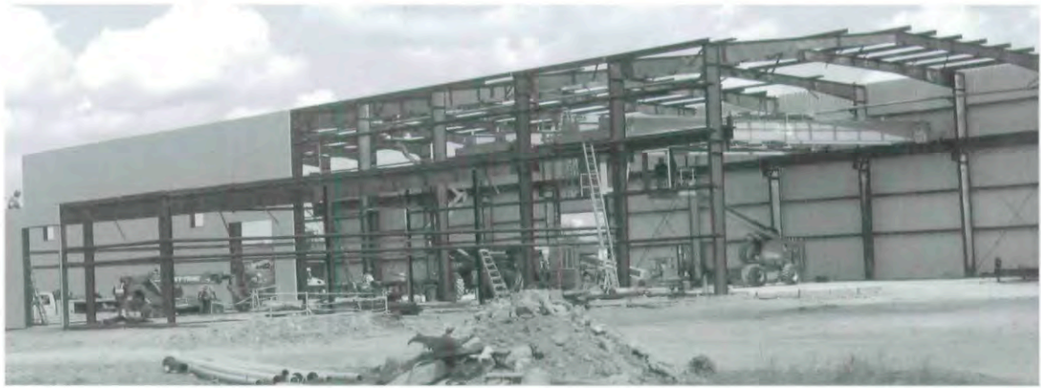
ShawCor Pipe Protection – new building expansion.

The establishment and execution of the BRE program has not only been a journey of challenges, but it has been a fulfilling journey as well. The BRE team genuinely enjoys helping our businesses; it is always a pleasure seeing business owners fulfill their business goals and dreams.